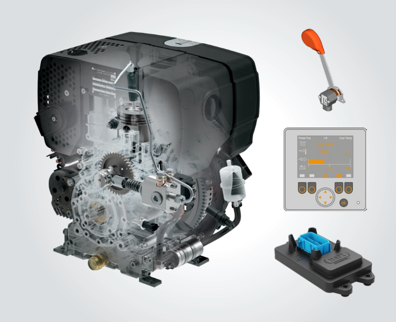
First Full Electronic and Full Variable Speed Control < 19 KW The models 1B30E, 1B30VE and 1B50E being part of the E1 family can be controlled by with standard J1939 CAN protokolls – thanks to the ECU controlling the engine. It is also possible to use CAN-Displays to monitor the engine performance.

Although not required by law, Hatz offers the 1B50E engine with an optional passive diesel particulate filter for EU Stage V for defined applications. This makes it possible to work in critical environments such as trenches.