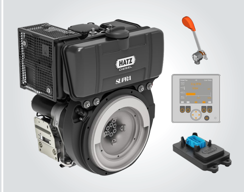
First Full Electronic and Full Variable Speed Control < 19 KW

For decades Hatz Silent Packs have been setting benchmarks for quiet and reliable diesel engines. Silent Pack is more than just an engine, it is a complete installation solution where the customer no longer has to take care of anything. Position, connect, start.