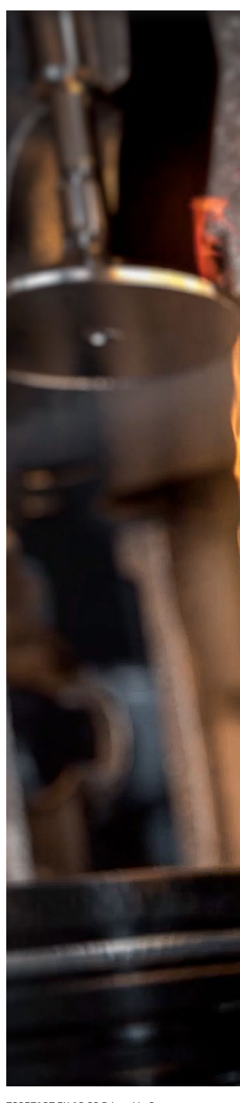
70257167 EN 10.22 Printed in Germany We reserve the right to make all changes that serve technical development.

Motorenfabrik Hatz GmbH & Co. KG Ernst-Hatz-Str. 16 94099 Ruhstorf a. d. Rott Germany Phone +49 8531 319-0 marketing@hatz.com hatz.com