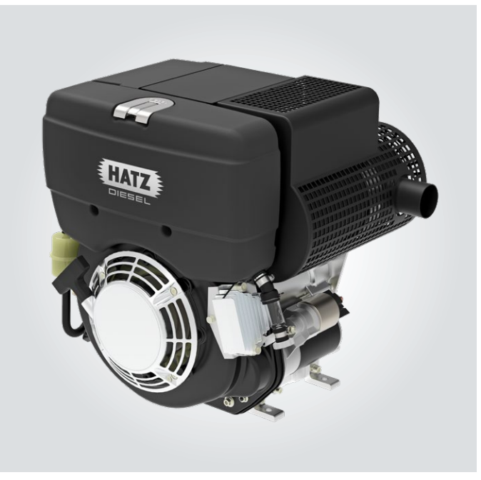
1B50E DPF with Diesel Particulate Filter

Depending on the engine type the already low noise level can be significantly reduced further, by 2 to 4 decibels, by an optional silent noise package, decreased power, and speed. This is possible thanks to optimisations in the area of intake and exhaust components.